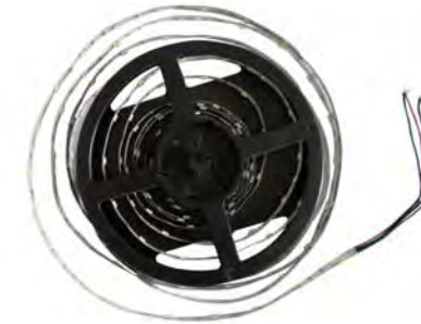
MCD - FSP-1210UWC-150--A